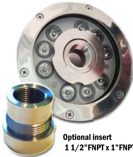
Optional insert 1 1/2" FNPT x 1" FNPT